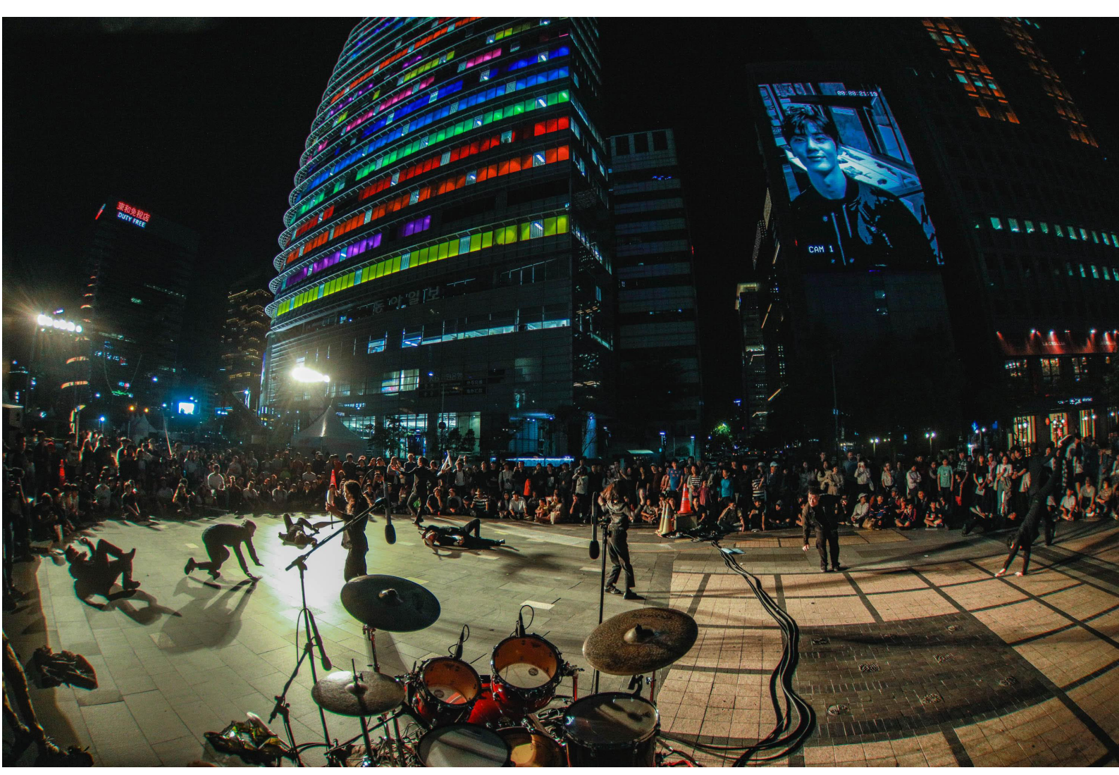
One shot # 117 Seoul Street Arts Festival, Seoul (South Korea) with a group of participants

For several years the Protocole collective has regularly given courses and workshops in France and abroad. During these we work to share our knowledge around improvisation and performance in public space. At the end of the training, the participants who become performers are fully integrated into one or more One shots #