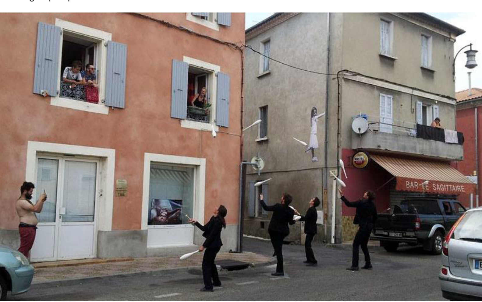
One shot # 68 INcircus with La Verrerie d'Ales . 2017, juggled quick attacks