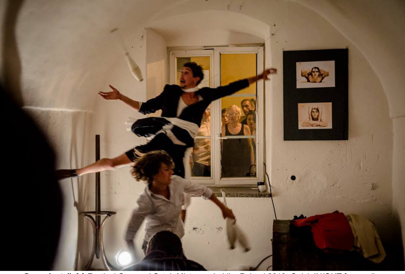
One shot # 11 Festival Carnaval Sztuk-Mistrzow, Lublin, Poland 2013, Quick IN/OUT for small group of public