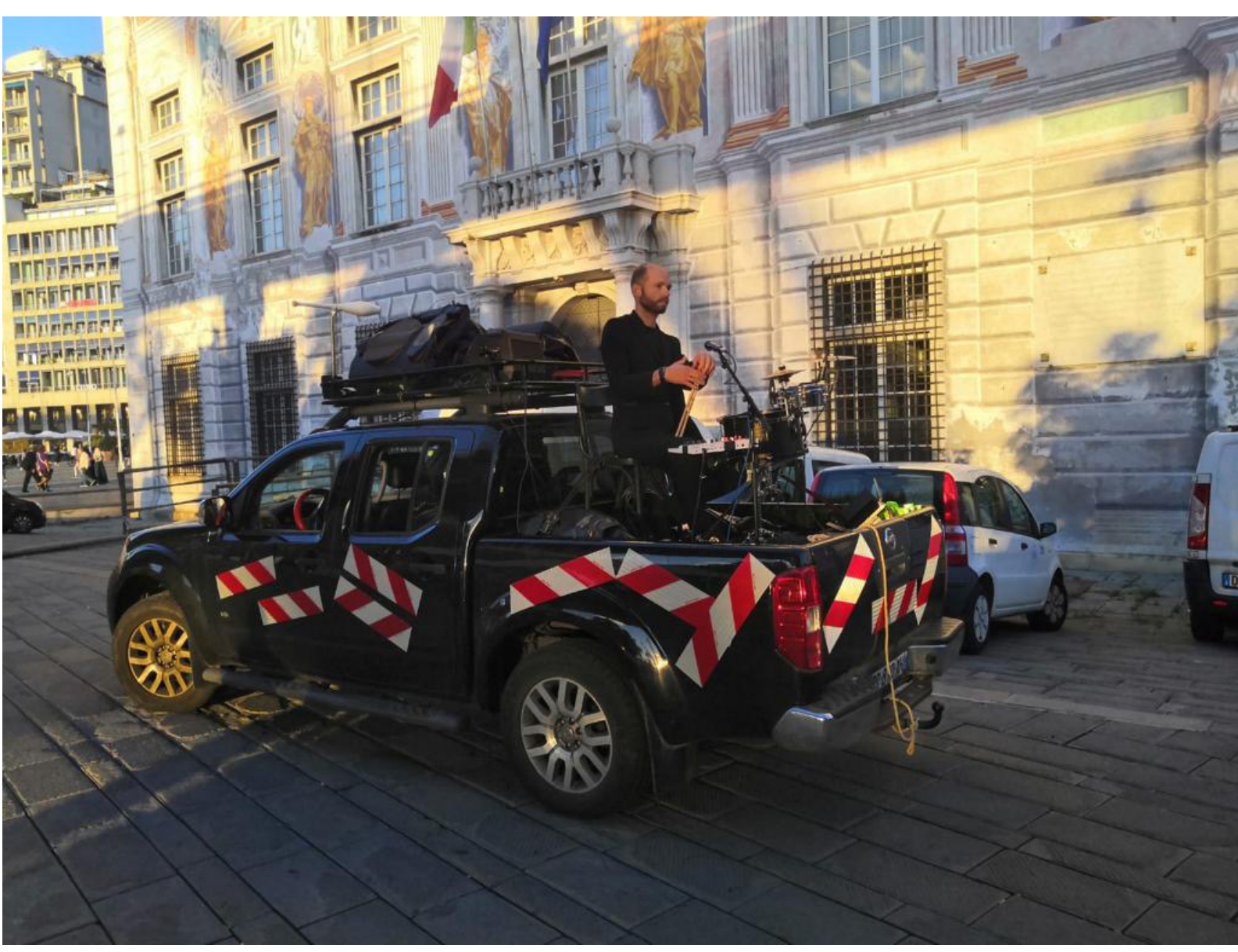
One shot # 171 during MURA in Genova (Italy) 2022, The Parade