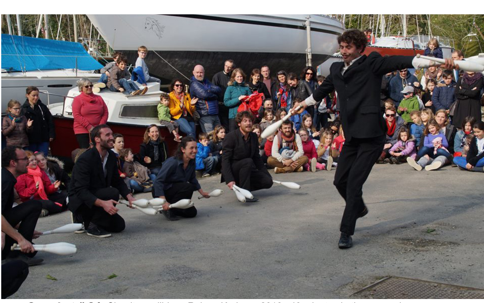
One shot # 34 Chapiteau d'hiver, Relecq Kerhuon 2016, .40 minutes in the same place